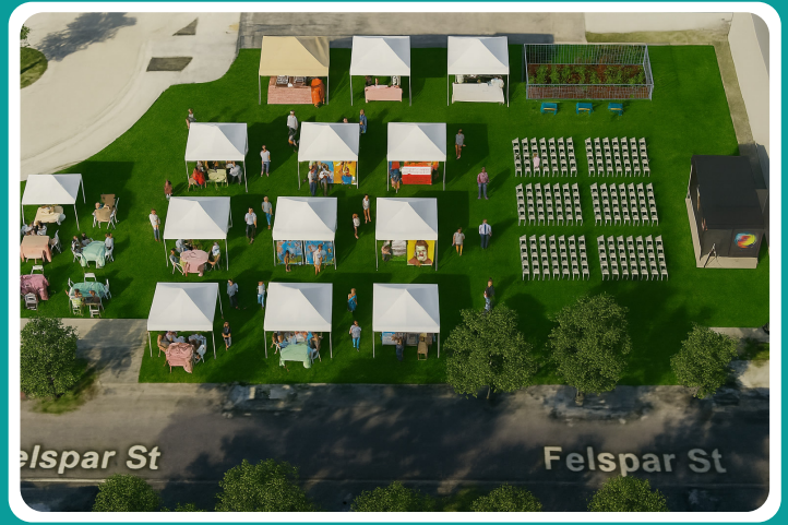
Outdoor Event Space